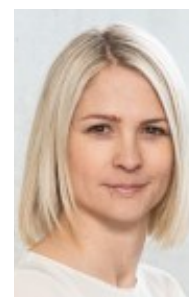
Associate Program Chair: