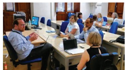
Impressions from the SAP Community Day 2023 in Cagliari